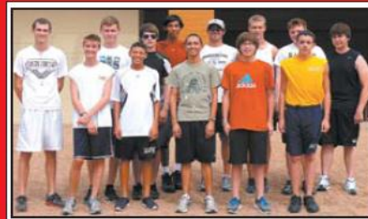
AJHS Boys Cross Country Impressive Run, see A-8